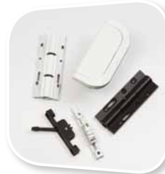
Bespoke British designed hardware