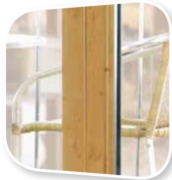
Gaskets are hidden with a patented trim